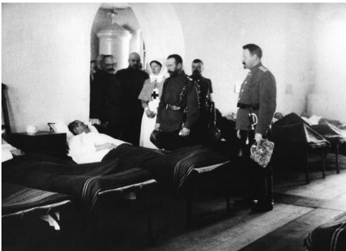
Emperor Nicholas II and his daughters at the military field hospital.