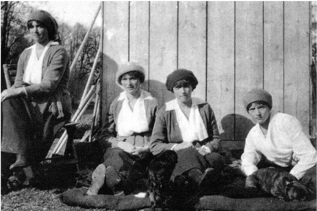
Grand Duchesses Maria, Olga, Anastasia and Tatiana during the house arrest in Tsarskoe Selo. Spring, 1917.

https://rg.ru/2017/05/14/velikaia-kniaginia-mariia-vladimirovna-ne-veriu-cto-nikolaj-by-slabyim-carem.html