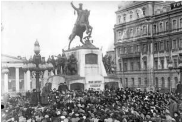
Spring 1917 in Tsaritsyn, a city in joy and jubilation

And should we reproach the emperor for this affair? Well, there was, we know, an affair between the emperor and Mathilda Feliksovna. She wrote about it herself years later. And I remember meeting and talking to her once. Though I was very young at the time, both she and my parents told me how things were then. She always carried with her a small photograph of the emperor. But to besmirch the emperor by alleging that he was still involved with her after his marriage to the empress is utter nonsense and untrue. Quite the opposite. As we all know, everyone reproached him for being too much of a loyal family man!